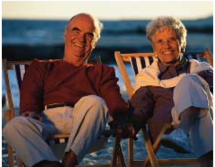
Something fun for Adults at Leacroft