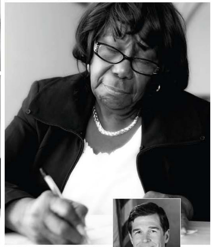
NC Attorney General Roy Cooper